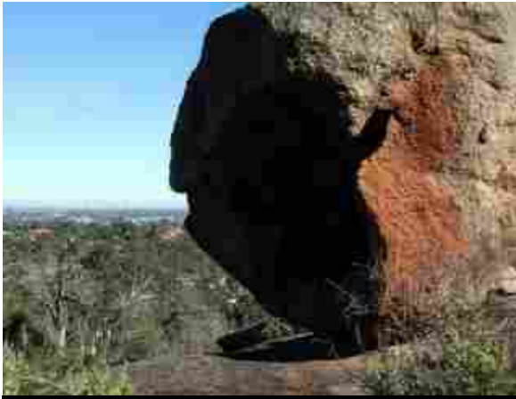
One of the amazing views on the Eagle View Walk